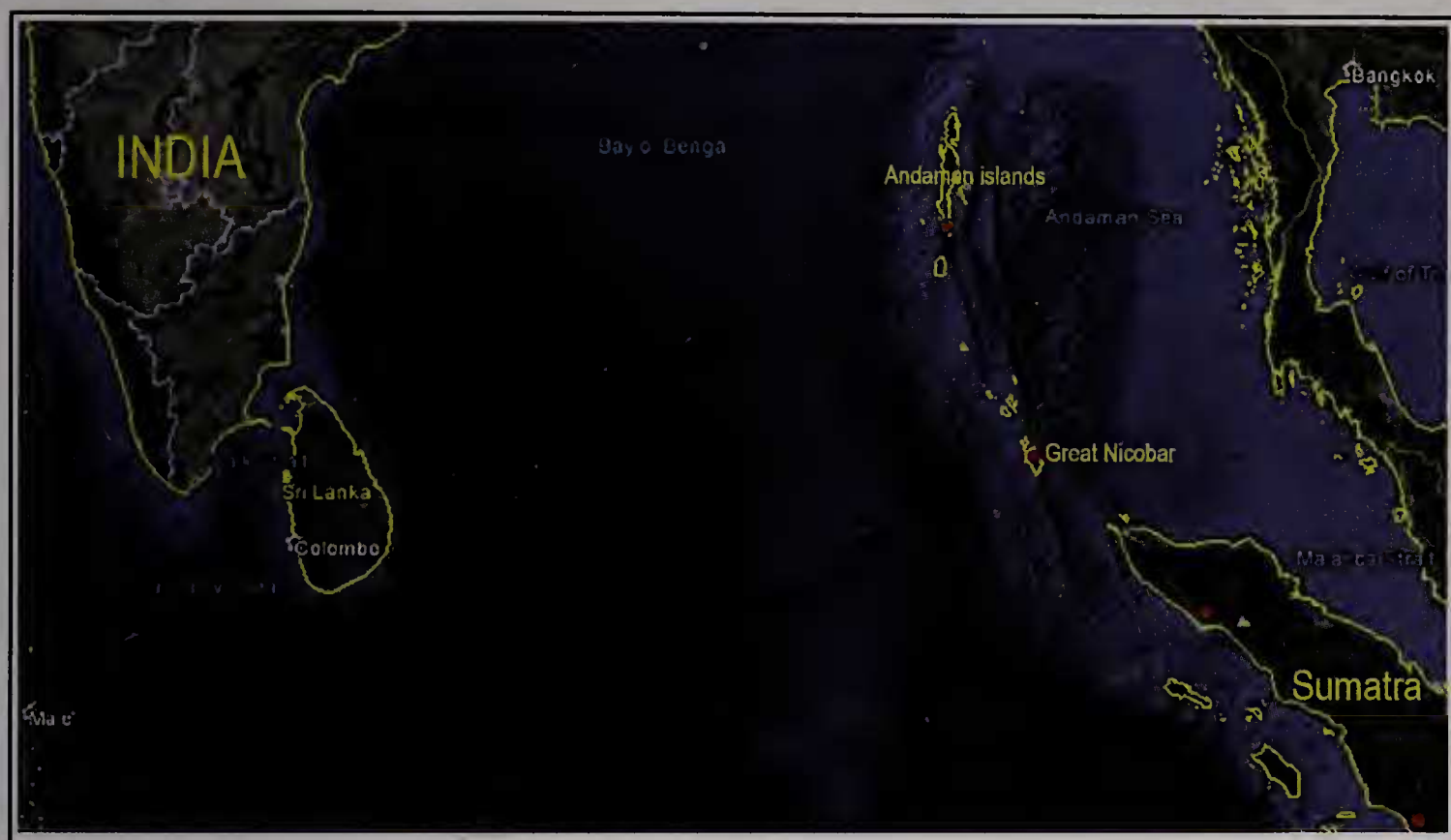
Fig. 2: Map showing the distribution of Phalaenopsis tetraspis (Map source: Google Earth)

Specimen examined: GREAT NICOBAR, Navy Dera, 30.05.2002, J.Jayanthi 19380 (PBL!); East-West Road, 29.11.1975, P.Chakraborty 3212 (PBL!); Navy Dera, 16.05.1980, D.K.Hore 7289 (PBL!), Laful, 06.05.1980, D.K.Hore 7767 (PBL!); Laful forest, 10.05.1981, R.P.Dwivedi 8526 (PBL!).